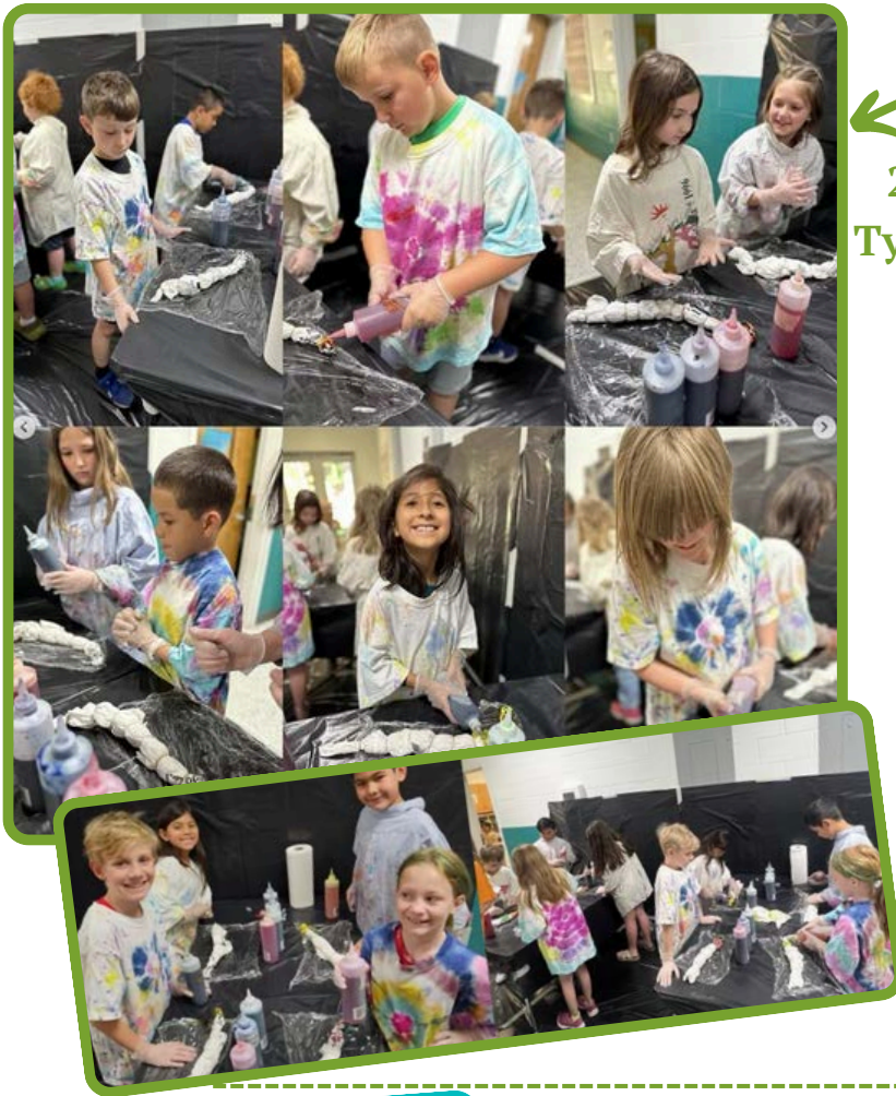
2nd Grade Tye Dye Day!