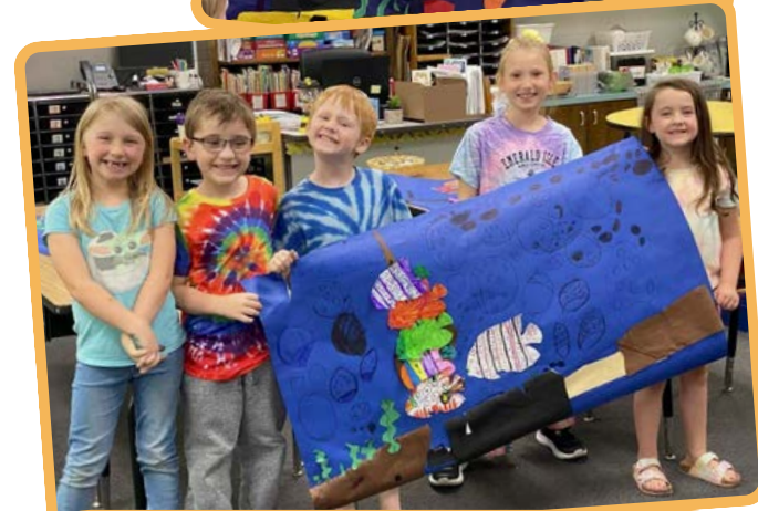
First grade classes worked in teams to show the story setting and important details from the story, Big Al , by Andrew Clements.