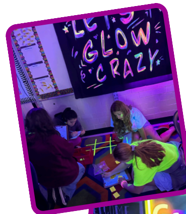
Students reviewed for math and reading EOGs at glow games stations!