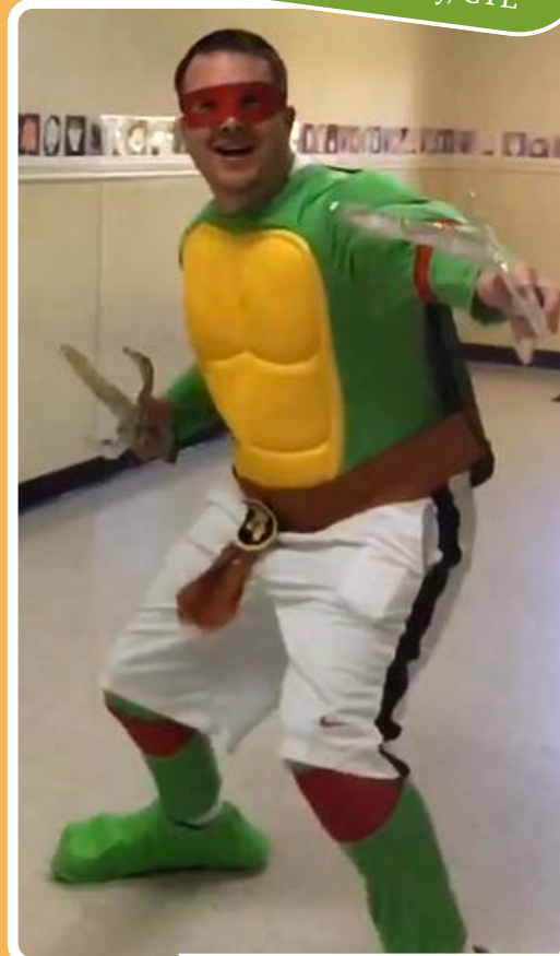
Playing it up as a Teenage Mutant Ninja Turtle