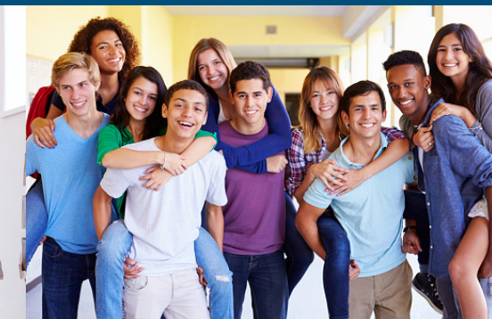
Summer Bridge June 18 - July 18