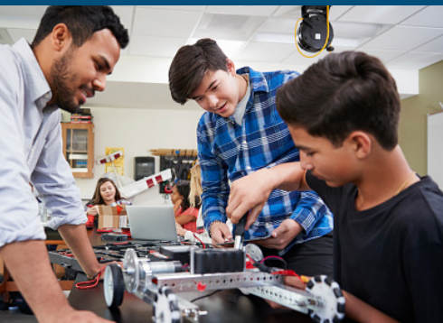
STEAM Academy June 17 - 21