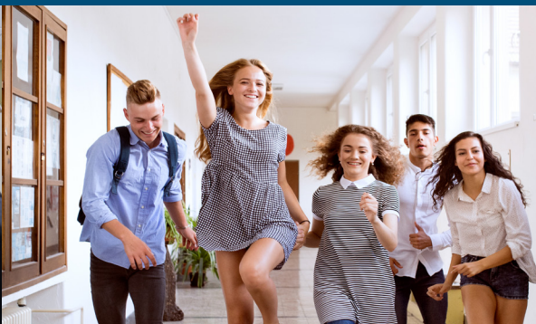
College & Career Leadership June 10 - 13